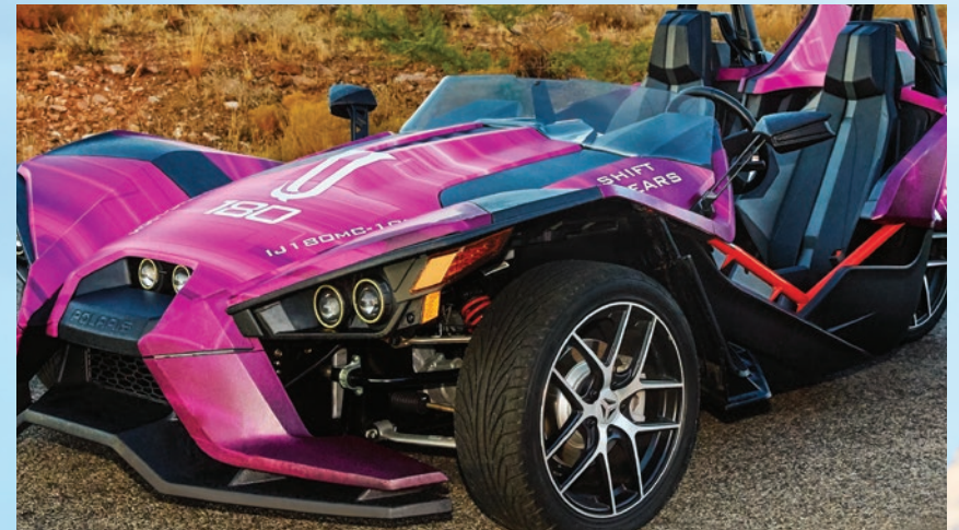
▲ Push your removals into hyperdrive.